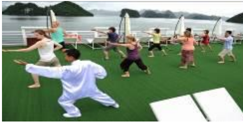
Activity on boat