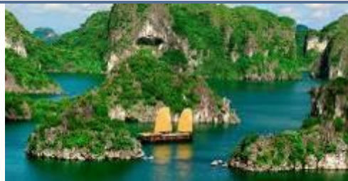
Ha Long Bay