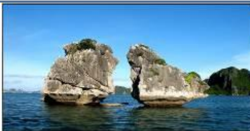
Ga Choi Island