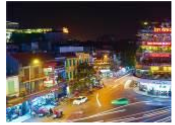
Hanoi Old Quarter

07.15: Cakes, fruits, tea and coffee will be served. Continue the cruise through Halong Bay.