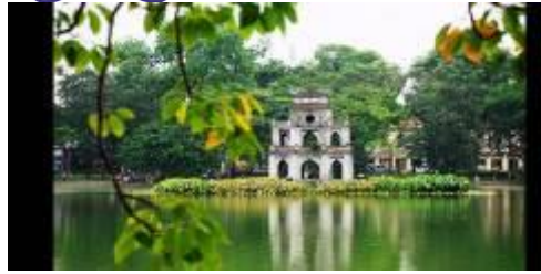
Pen Tower - Hoan Kiem Lake