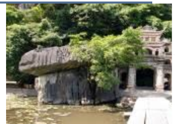
Bich Dong Pagoda

Morning: Proceed to Tam Coc to visit "Halong Bay on land" - the same limestone rocks as in Halong Bay but seen from a winding stream through paddy fields instead of the sea. Enjoy spectacular scenery during the boat trip to Tam Coc caves with visit of the Bich Dong Pagoda . Lunch at local restaurant. Afternoon: Transfer back to Hanoi. Dinner at local restaurant and Overnight in Hanoi.