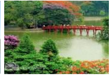
The Huc Bridge

Morning: you will board the wooden junk to visit Halong Bay. While cruising through the bay, seafood lunch is served on board. Visit Thien Cung cave; circle Tuan Chau, Ga Choi, Dinh Huong, Dog and Sail Islets and islands . After lunch, drive back to Hanoi. Stop at shopping centre in the middle Hanoi and Halong for shopping and relax. Check in hotel in Hanoi.