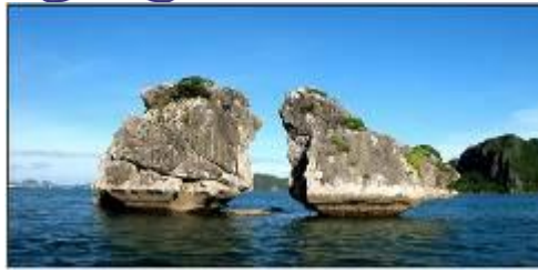
Ga Choi Island