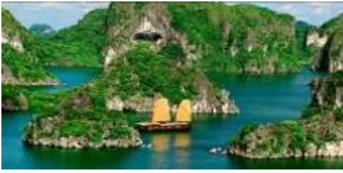
Ha Long Bay