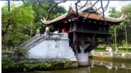
One Pillar Pagoda