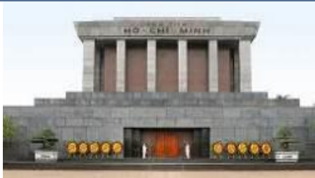
Ho Chi Minh Mausoleum