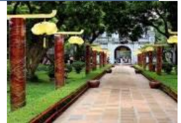
Temple of Literature

Morning city tour: visit Ho Chi Minh's House, Museum and His Mausoleum (closed on Monday, Friday and the whole months of October-November), One-Pillar Pagoda . Continue to visit Buddhist Tran Quoc Pagoda on West lake (One of the oldest in Vietnam). Temple of Literature , built in the 11th century as Vietnam's first university. Lunch at local restaurant.