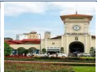
Ben Thanh Market

Morning: Visit The Hundred Years Red Cathedral, Old Post Office, The People's Committee Hall, French Opera House, War Museum and Ben Thanh Market. Buffet Lunch at local restaurant.