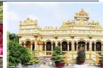
Vinh Trang Pagoda

Morning: Heading out of the town, we travel by roads to the Mekong Delta , Vietnam's largest rice bowl. On arrival in My Tho, we embark on a boat navigating around the intricate small canals in the delta region, which is a great way to observe the local lifestyle close-up and catch a view dotted by many islands. The exciting excursion will pass the lush green vegetation before arriving at the famous Unicorn Island . Here we have opportunities to stroll around an orchard, taste many seasonal fruits and enjoy wonderful traditional music .