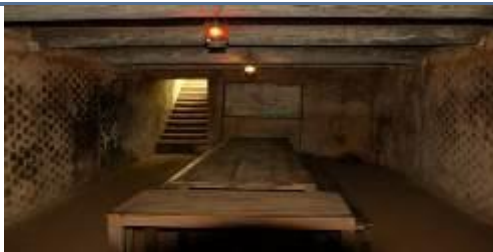
Cu Chi Tunnel