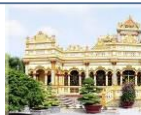
Vinh Trang Pagoda

Morning: Heading out of the town, we travel by roads to the Mekong Delta , Vietnam's largest rice bowl. On arrival in My Tho, we embark on a boat navigating around the intricate small canals in the delta region, which is a great way to observe the local lifestyle close-up and catch a view dotted by many islands. The exciting excursion will pass the lush green vegetation before arriving at the famous Unicorn Island . Here we have opportunities to stroll around an orchard, taste many seasonal fruits and enjoy wonderful traditional music . The next stop of our trip is Ben Tre Province to visit some fascinating local industries. After feasting on a huge lunch we return to Ho Chi Minh. Free at leisure. Dinner & Overnight in HCM City.