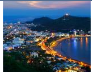
Vung Tau City

Morning: We drive out this morning, to explore the Cu Chi Tunnels , an incredible underground network constructed by Vietnamese fighters during the long struggle for independence. The tunnels contained hospitals, plus accommodation and schools, and were used as a military base for the Vietcong in the American war. Lunch at local restaurant.