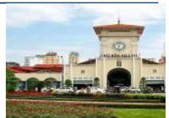
Ben Thanh Market

Morning: Morning: Continued visit to the Summer Palace of the Emperor Bao Dai , the Jesus Monument , which overlooks the Peninsula and the Pacific Ocean . Transfer back to Ho Chi Minh city. Lunch at local restaurant.