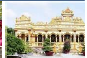
Vinh Trang Pagoda

Morning: Heading out of the town, we travel by roads to the Mekong Delta , Vietnam's largest rice bowl. On arrival in My Tho, we embark on a boat navigating around the intricate small canals in the delta region, which is a great way to observe the local lifestyle close-up and catch a view dotted by many islands. The exciting excursion will pass the lush green vegetation before arriving at the famous Unicorn Island . Here we have opportunities to stroll around an orchard, taste many seasonal fruits and enjoy wonderful traditional music . The next stop of our trip is Ben Tre Province to visit some fascinating local industries. Lunch will be served at a local restaurant before driving to Can Tho. Dinner and overnight in Can Tho.