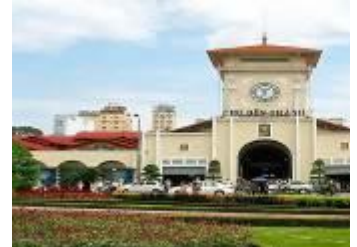
Ben Thanh Market

Meet on arrival at Ho Chi Minh City / Tan Son Nhat International Airport and transfer to hotel.