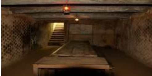
Cu Chi Tunnel