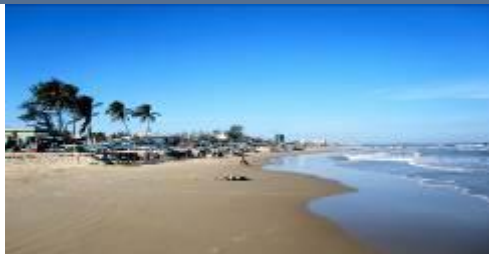
Vung Tau Beach