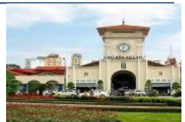
Ben Thanh Market

Morning: Morning: Continued visit to the Summer Palace of the Emperor Bao Dai , the Jesus Monument , which overlooks the Peninsula and the Pacific Ocean . Transfer back to Ho Chi Minh city. Lunch at local restaurant.