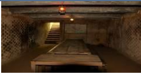
Cu Chi Tunnel