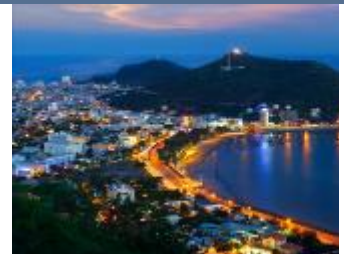
Vung Tau City

Morning: We drive out this morning, to explore the Cu Chi Tunnels , an incredible underground network constructed by Vietnamese fighters during the long struggle for independence. The tunnels contained hospitals, plus accommodation and schools, and were used as a military base for the Vietcong in the American war. Lunch at local restaurant.